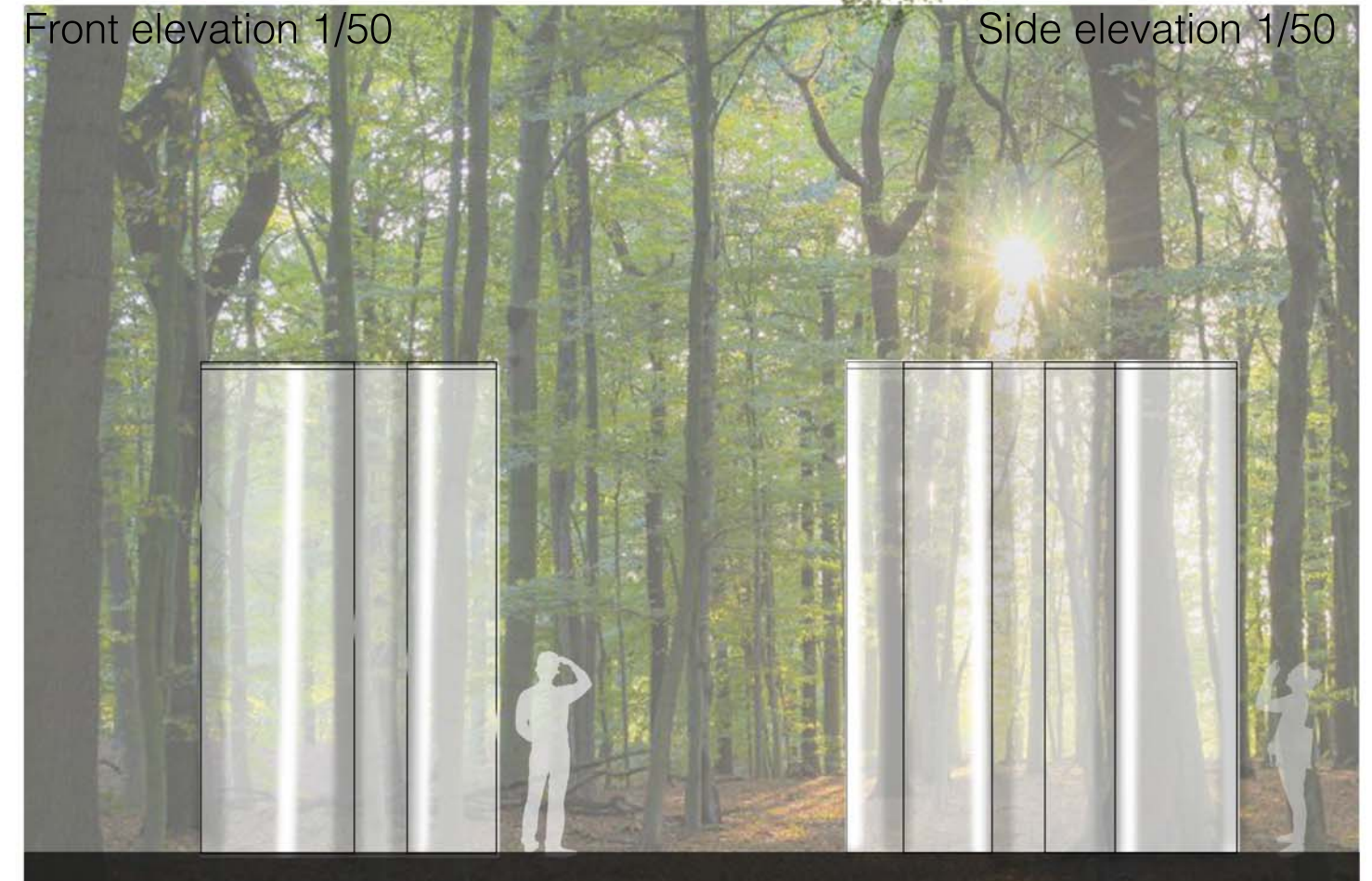
Side elevation 1/50