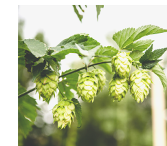
Humulus lupulus Hop Plant