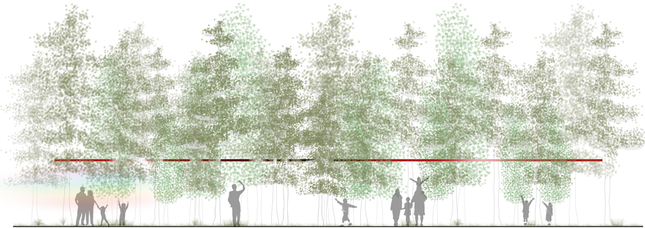
LONGITUDINAL SECTION 1/100