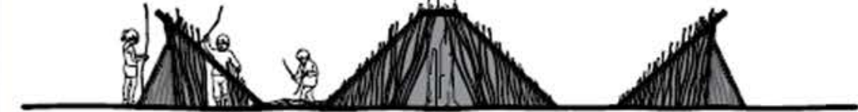
plan and elevation scale 1:100