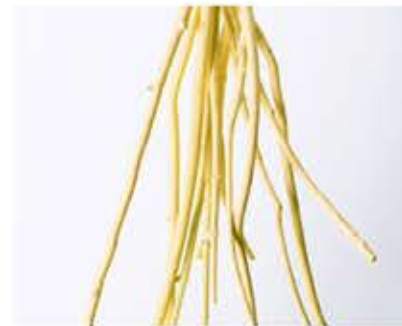
brightly coloured branches