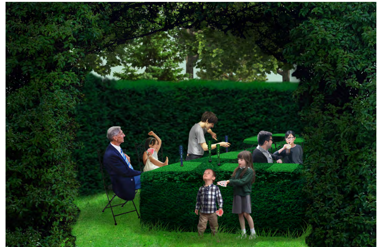
INTERIOR GARDEN GAMEPLAY