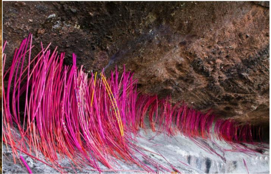
插在石缝石洞中的香 Incenses inserted in caves