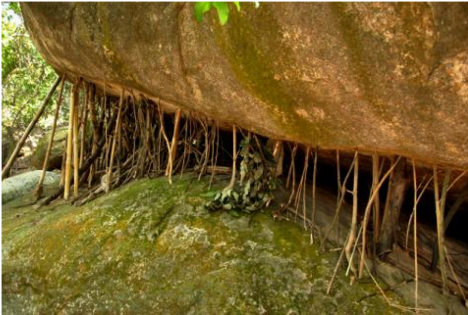
插在石缝石洞中的小树枝 Small branches inserted in caves