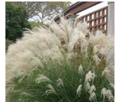
Miscanthus Sinensis Yuka Jima