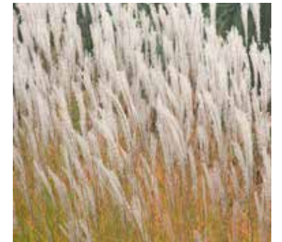
Miscanthus Sinensis Purpurascens