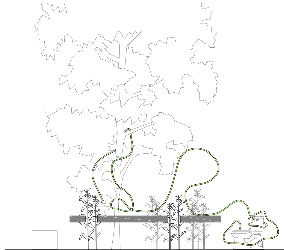
CONCEPT SECTION B