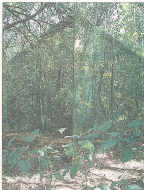
Reflections Colorées, by Montreal architect Hal Ingberg: a dramatic green structure made of two kinds of glass that simultaneously reflects the natural area around it and reveals the garden within.